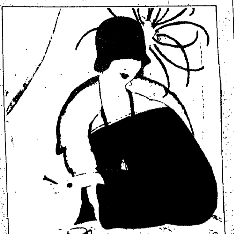
Piquet 1922: Flowerpot of picnic straw with cock feathers and roses on the cover of a 1922 edition of Vogue. The first 24 years of British Vogue from 1916 to 1939 have now been published on microfiche...

A quarter hat of picnic straw with cock feathers and roses on the cover of a 1922 edition of Vogue. The first 24 years of British Vogue from 1916 to 1939 have now been published on microfiche, making them readily available for students and researchers, by Mindata Ltd.